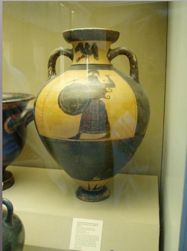
Black-figure hydria This vase is a hydria, a type of vase used for carrying water. It is decorated with a female figure, possibly a personification of Justice or a deity, wearing a long, patterned dress and holding a large, circular object. The vase is made of black clay and is decorated with black figures on a light background.