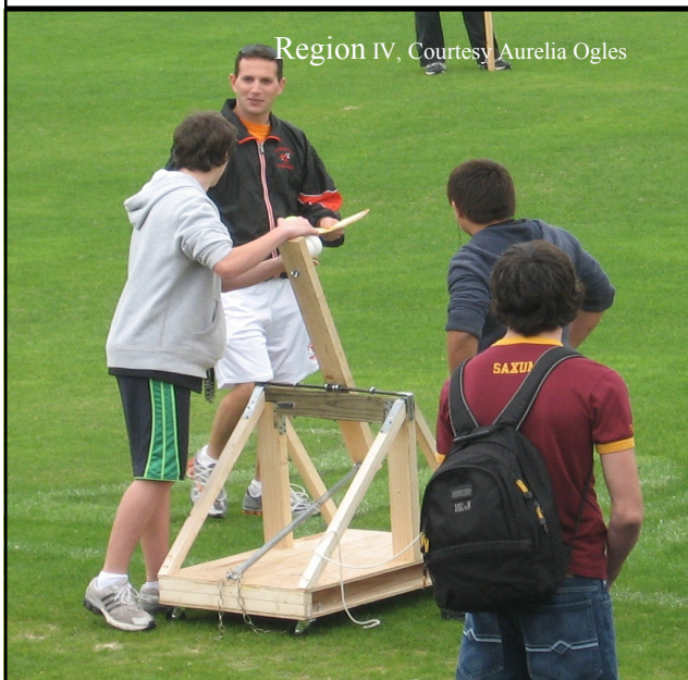
Region IV